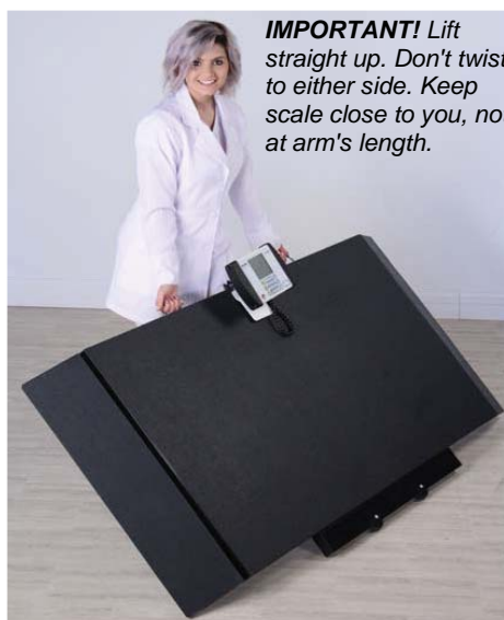
Lifting from or Lowering Scale to Floor (Storage Position)

IMPORTANT! Lift straight up. Don't twist to either side. Keep scale close to you, not at arm's length.