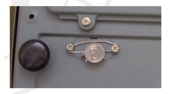
Calibration access via lead wire seal