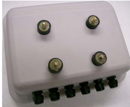
Model 212-G / Model 212-GX Rear Panel