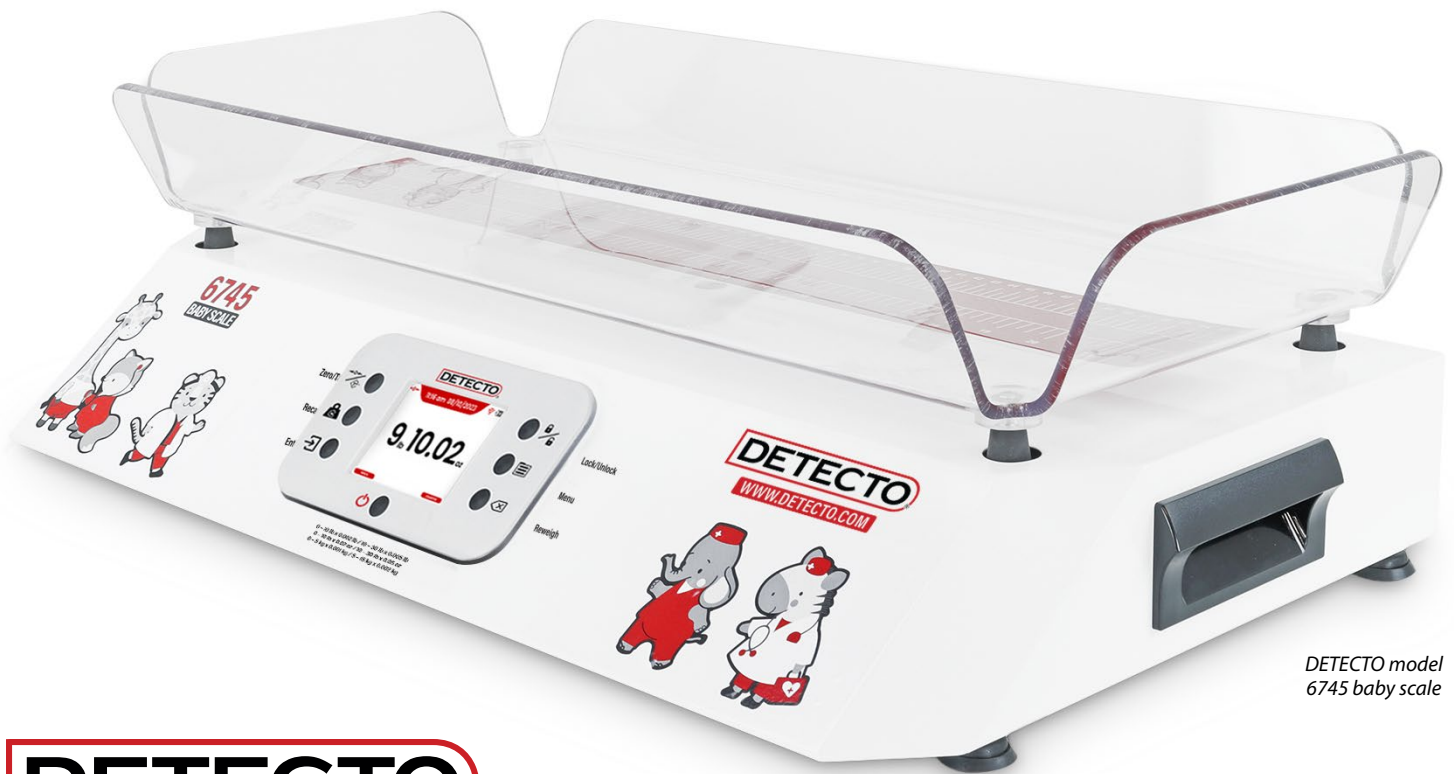
DETECTO model 6745 baby scale