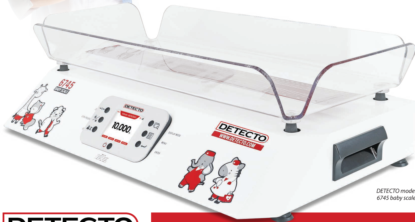
DETECTO model 6745 baby scale