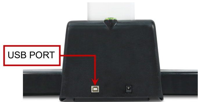
Location of icon USB port (rear of scale base)