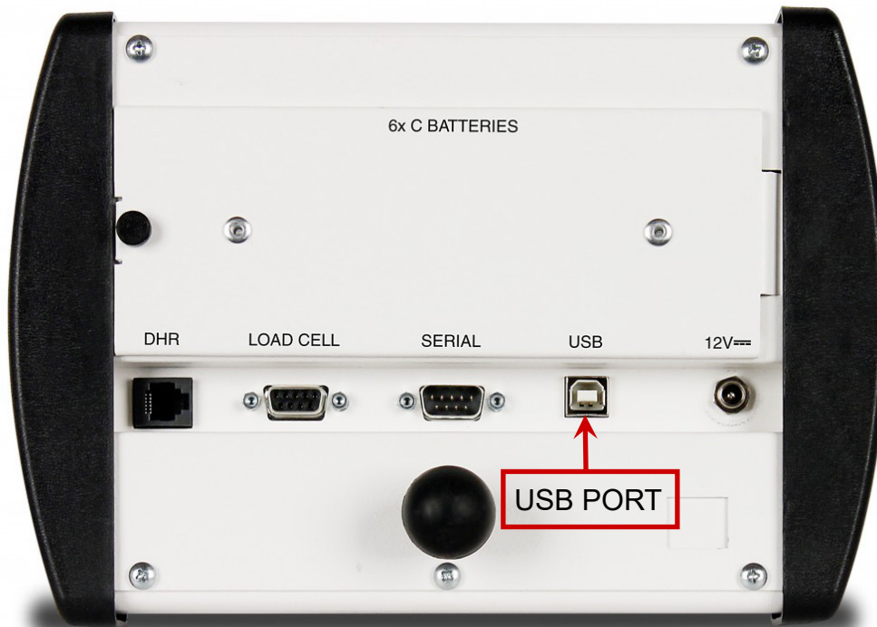
Location of USB port on back of MedVue