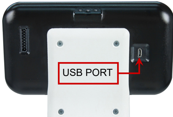
Location of apex USB port (back of display)