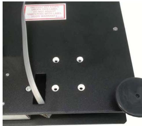
Figure No. 3