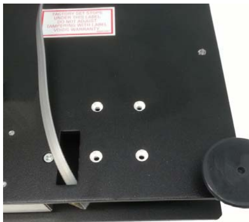
Figure No. 3