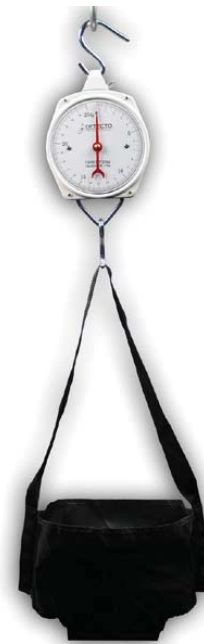
Figure No. 1