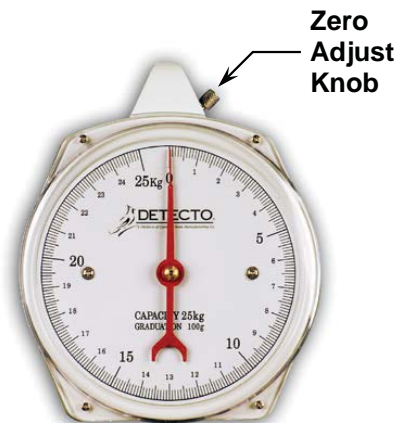
Figure No. 2