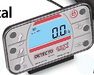
DETECTO Model APEX-RI

These digital flat scales let the patient weighing come to you!