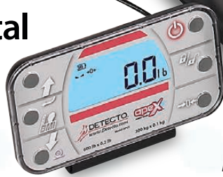
DETECTO Model APEX-RI

These digital flat scales let the patient weighing come to you!