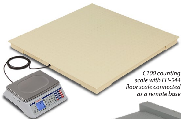
C100 counting scale with EH-544 floor scale connected as a remote base