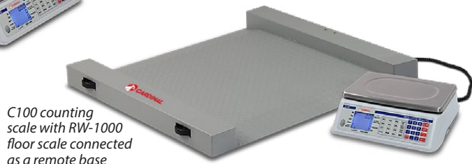
C100 counting scale with RW-1000 floor scale connected as a remote base