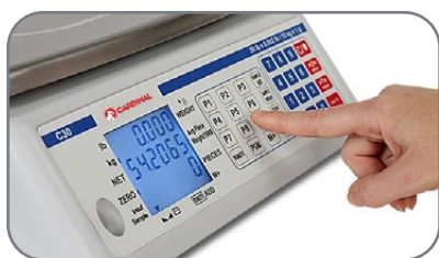
Product look up preset keys speed counting operations

These durable counting scales feature a full keypad to enter and recall known piece weights and tare weights, metric conversion, large backlit single LCD, bubble level, and non-skid feet for stability.