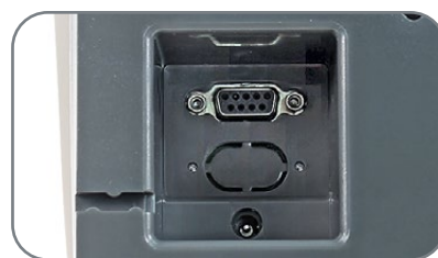
Includes second scale input port (remote scale only)