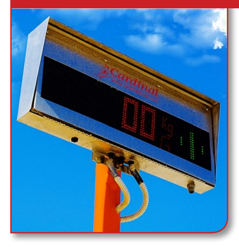
Continued from pg. 1

The vehicle weighbridge became operational September 9, 2015. Approximately 30-40 trucks are weighed daily. With the purchase and installation of the new equipment, Samra Plant 0&M Co. is excited to report that the Cardinal digital display is accurate and easy to read. Process Manager Mr. Mohammed reports, "The accurate readings of sludge volume enable us to achieve good accuracy in plant mass balance calculations." This capability is a great asset to Samra and, in turn, the surrounding community.