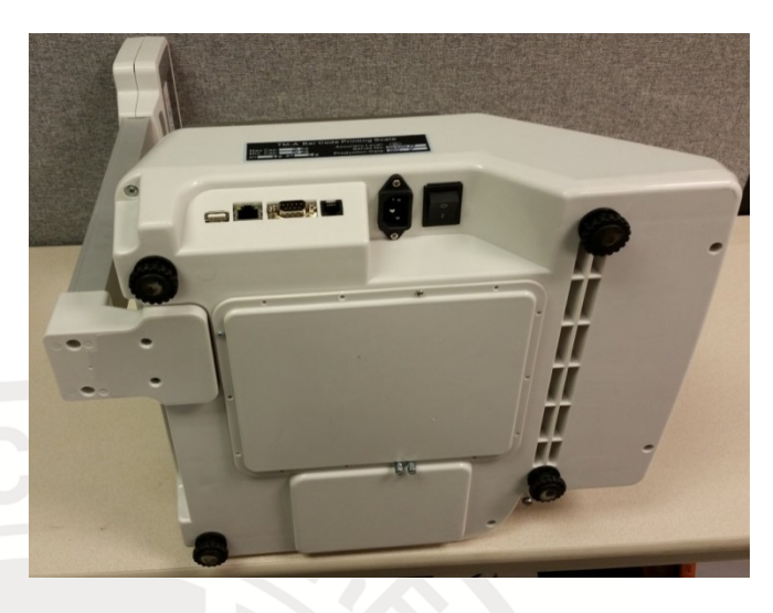
Sealing Access Panel on Bottom