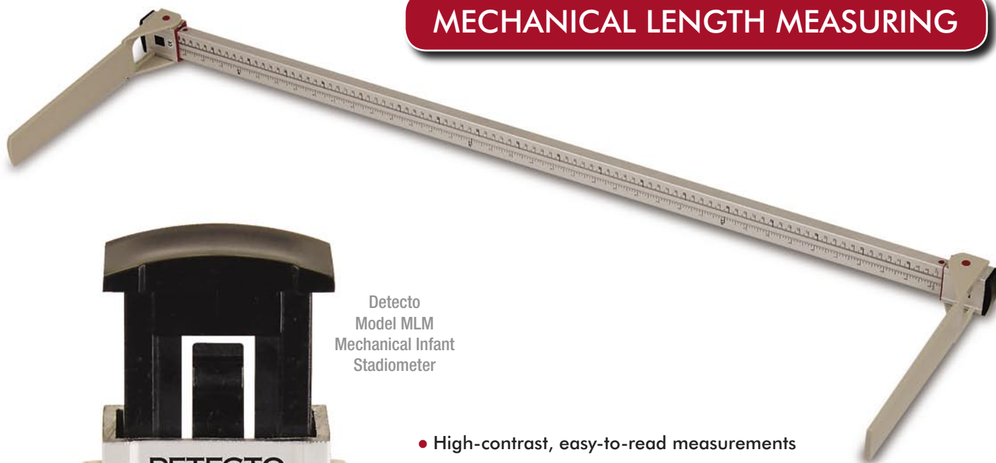
Detecto Model MLM Mechanical Infant Stadiometer