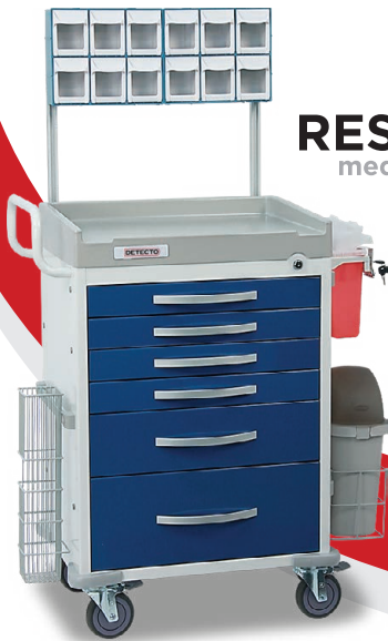
RESCUE medical carts