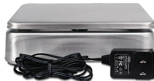
Comes with UL/CSA-listed wall plug-in power supply and internal rechargeable battery pack