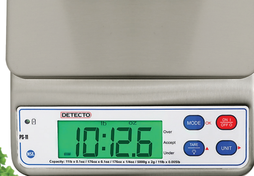
Bold, easy-to-read, 0.8-inch/20-mm high backlit LCD with checkweighing mode