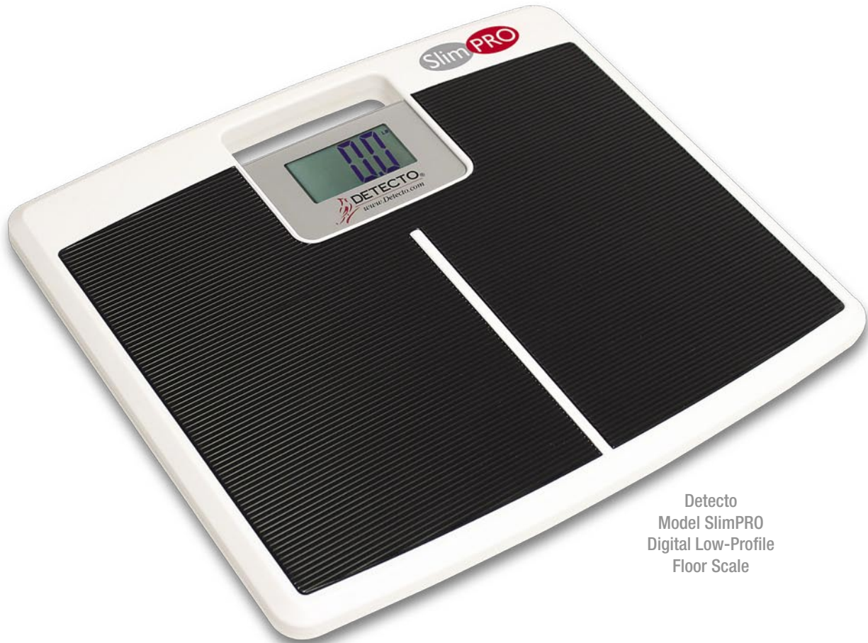
Detecto Model SlimPRO Digital Low-Profile Floor Scale