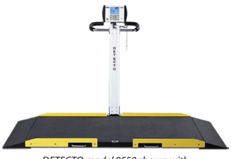
DETECTO model 8550 shown with optional yellow guide rails