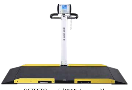
DETECTO model 8550 shown with optional yellow guide rails