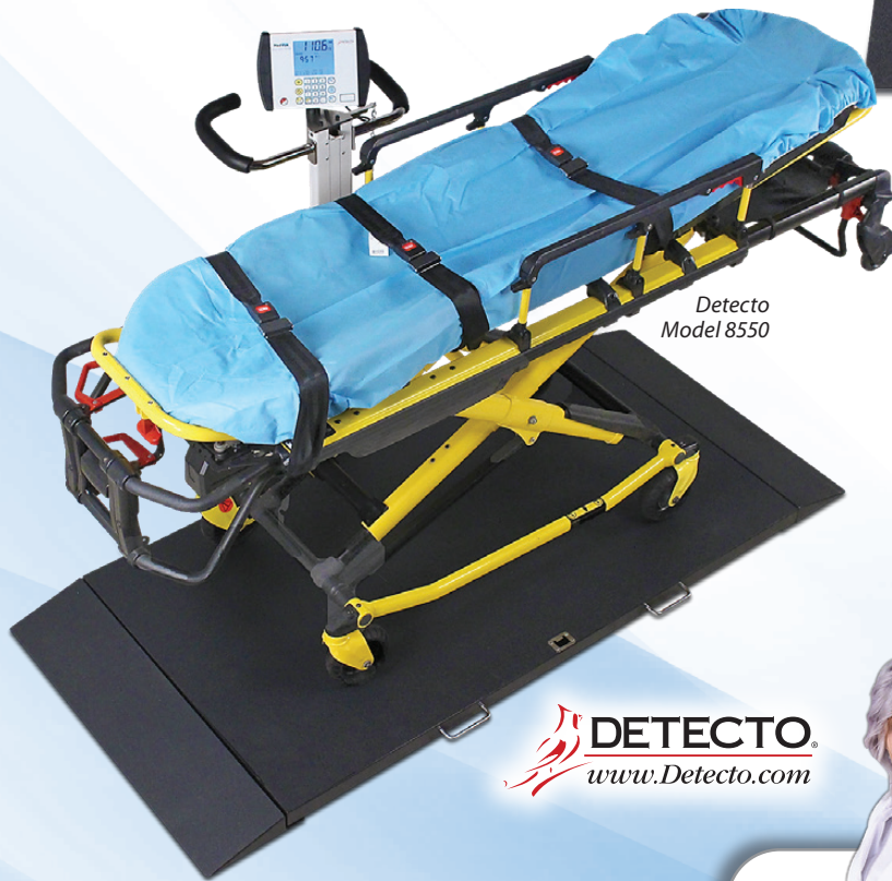
Detecto Model 8550