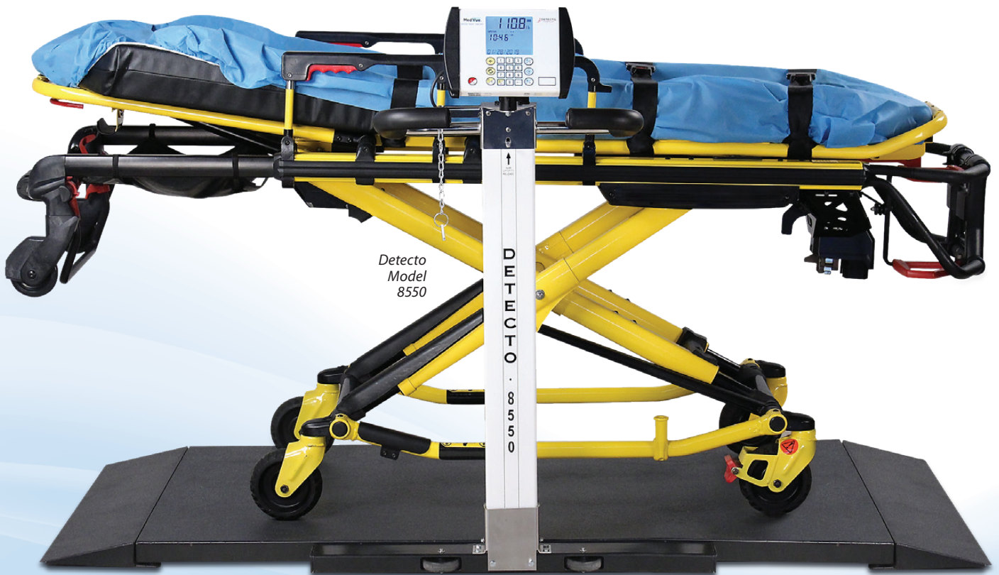
Detecto Model 8550