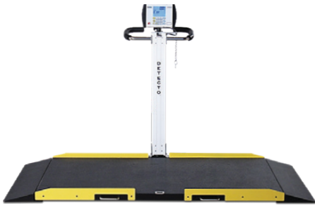
DETECTO model 8550 shown with optional yellow guide rails