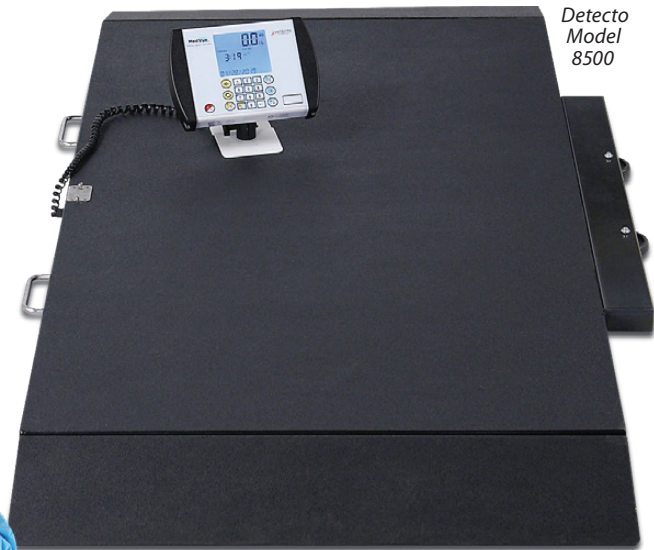
Detecto Model 8500