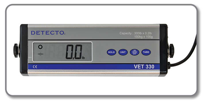
The VET-330WH's one-inch/25-mm high LCD display provides easy-to-read weights clearly visible up to 25 ft away. The HOLD key retains the animal's weight during movement.