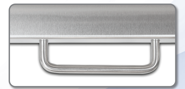
The stainless steel guide handle allows you to manuever the scale wherever needed.

Assembly is easy! Simply screw on the four non-skid leveling feet, install the mounting bracket to the display, and it's ready to weigh right out of the box.