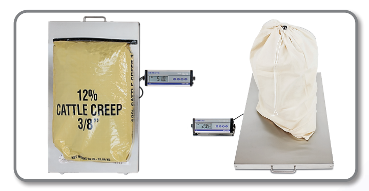
The scale's roomy 36 in W x 22 in D x 1.97 in H / 90 cm W x 55 cm D x 5 cm H stainless steel platform allows it to be used for a wide range of purposes.

Two integral wheels ease transportation of the scale to multiple weighing locations.