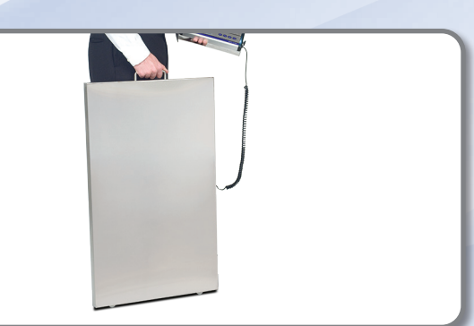
The scale is completely portable and can be raised vertically and rolled wherever needed via its carrying handle and wheels.