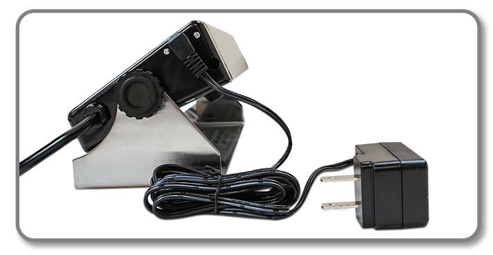
The scale comes with a UL/CUL listed AC power adapter that charges the built-in rechargeable battery pack. A wall or desk mount display bracket and mounting hardware is also included.