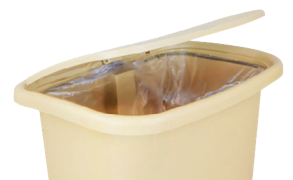
Soft close lids gently lower back into closed position