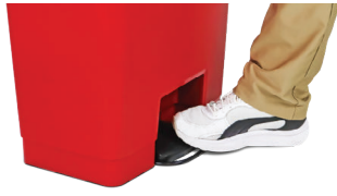
Foot pedal flips open lid for quick trash disposal