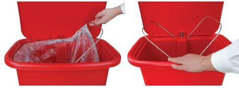
Internal clamps cleanly secure trash bags to the rim of the container