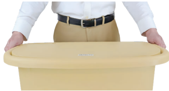
Upper lips are ergonomically designed for comfort and ease of transport